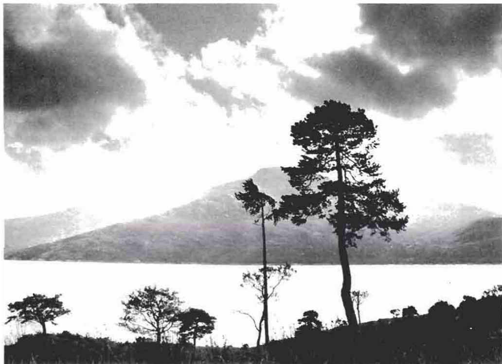
ABOVE...THE BEAUTY OF LOCH GARRY IN THE AUTUMN, JUST OFF THE A87 MAIN ROAD.

Nearing the end of my cigarette I realised that the peaceful but strange silence was disturbing me. Why was it so quiet and why were there no birds singing? Could it possibly be that a legendary Golden Eagle had its eyrie in that small knot of trees just above and behind me?