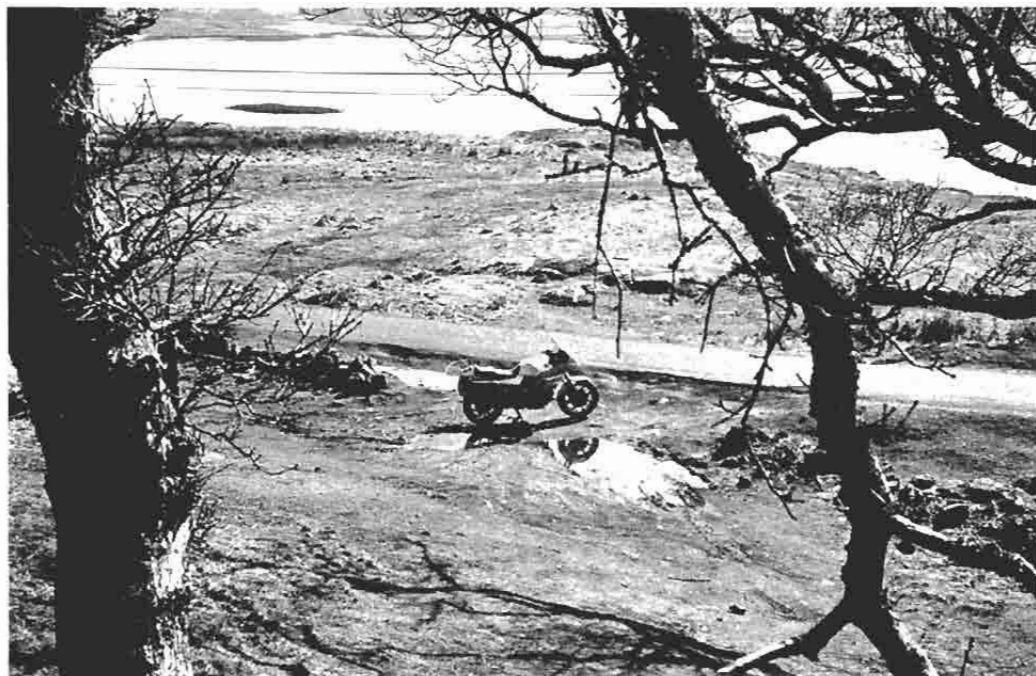
ABOVE...BESIDE LOCH NA KEAL ON THE WEST COAST OF THE ISLE OF MULL.

At that moment something above me, to the right, entered my peripheral vision. Immediately I looked up. It was a bird and a large one at that. But I was given no time to dwell on it, or study it. Instantly it dived, arrowing across my line of vision and plummeting towards earth, some hundreds of feet below. My eyes followed it as best they could, but it quickly disappeared into the gold and brown camouflage of the rugged terrain. I don't know if it was a Golden Eagle, but I like to think it was. Whatever it was, the speed of its descent was like that of a guided missile and I'm certain its prey would have had little chance.